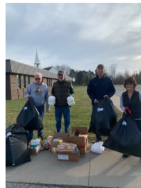
The Angel's ready to help families load their cars