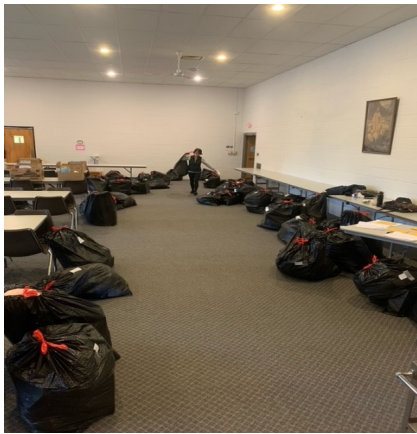
Gifts are bagged so the children don't see what they are getting

Thank you to everyone who helped make the Thanksgivings and Christmas for several local families a bit brighter by donating turkey's, gifts of toys, clothes, and food baskets. It would not have been possible without your continued support.