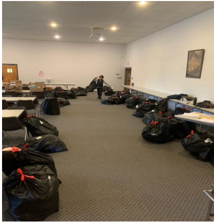
Gifts are bagged so the children don't see what they are getting

Thank you to everyone who helped make the Thanksgivings and Christmas for several local families a bit brighter by donating turkeys, hams, gifts of toys, and clothes for the baskets. It would not have been possible without your continued support.