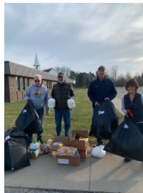
The Angel's ready to help families load their cars