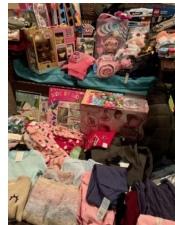
Donations are carefully sorted