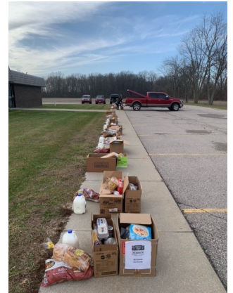
Each family received milk & other perishables along with canned good & meat for several meals.