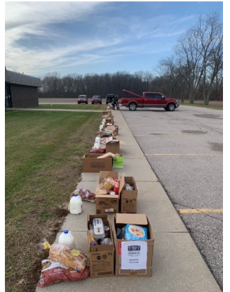
Each family received milk & other perishables along with canned good & meat for several meals.

The Angel's ready to help families load their cars